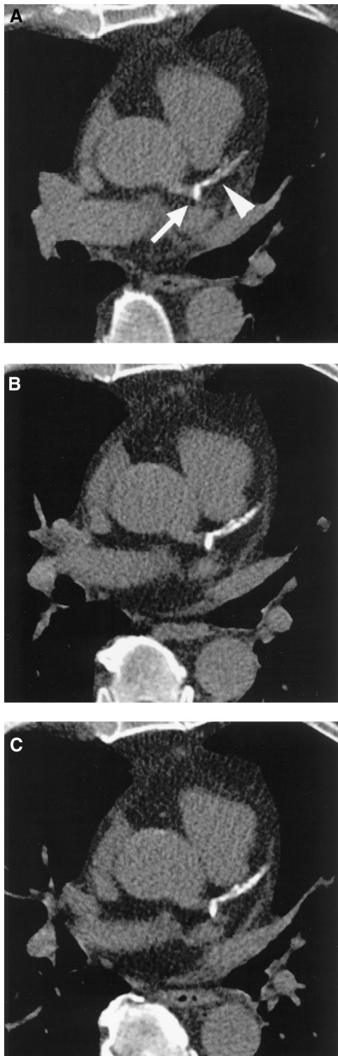
Figure 1. Axial cross-sections (3-mm slice thickness) obtained by electron beam tomography in a 63-year-old patient at baseline (A), after 12 months without lipid-lowering treatment (B), and after 12 months of treatment with cerivastatin. The images show calcifications in the bifurcation of the left main coronary artery (arrow) and proximal left anterior descending coronary artery (arrowhead). Although an obvious increase can be seen from the first to the second EBT scan, there is only a slight increase from the second to the third EBT scan. Total volume score in EBT scan 1, 1143 mm 3 ; in scan 2, 1488 mm 3 ; and in scan 3, 1511 mm 3 .